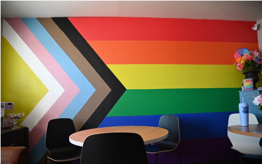
Mural at The Center run by LBU.