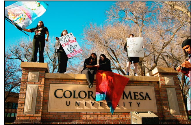
Pro-Immigrant, anti-ICE rally Feb. 8, saw hundreds participate for some part of the five hour long, spirited rally. The hanks of support were deafening at times.