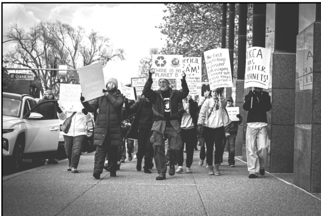
People's March GJ, Jan. 19.