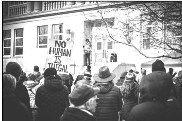
125 people gather for the Jan. 19 People's March in Grand Junction.