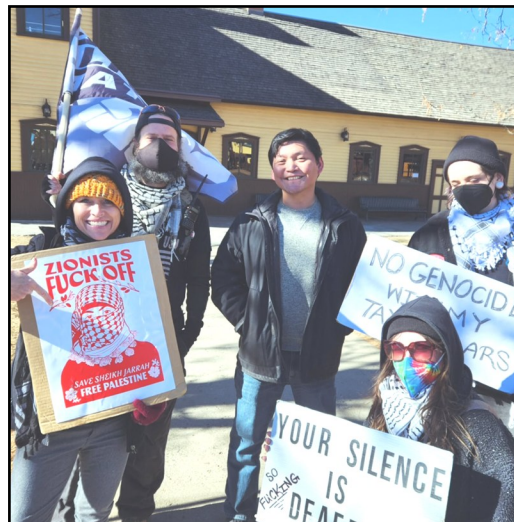
4 Corners 4 Palestine at the People's March Durango. Jan. 19.