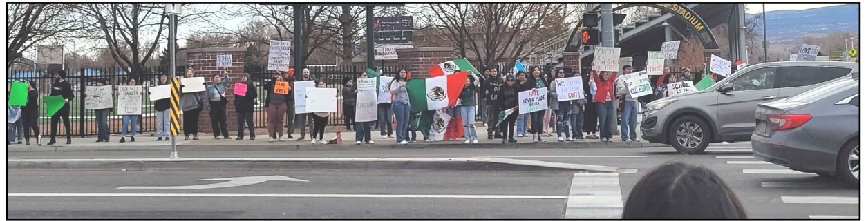
Large rally against ICE and in support of our immigrant and latino communities. 12th and North Ave. Grand Junction. Feb 1.