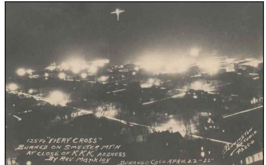
KKK, the original Christian Nationalists burn a cross above the town of Durango April 22, 1925.

and subjugated the indigenous populations that were already here, but the United States constitution was designed to prevent any religious group from controlling the government—as I previously illustrated. Organizations like the Moral Majority and Counsel for National Policy have aimed to destroy that protection in more recent history, and religious leaders across the United States today are committed to promoting Christian nationalism at the expense of democracy. Furthermore, many of these religious leaders explicitly purport the falsehood that the U.S. was founded as a Christian nation—and their followers real-