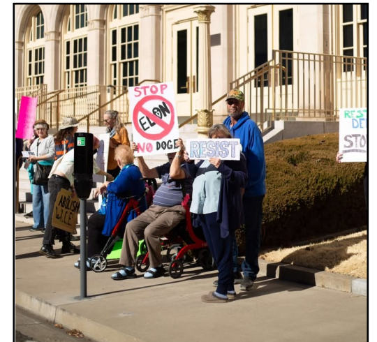
About 60 people rallied at the Federal Building in Grand Junction, in conjunction with 50501 protests which took place in all 50 states on Feb. 5.