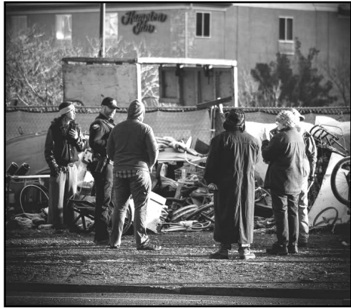
Jan. 6, Mesa County DSA on scene as GJPD evicts a homeless encampment at 1st and Ute.