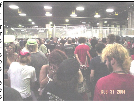
Secret DHS Detention center in use at the Republican National Convention, NYC. 2003.

In 2013, the Supreme Court upheld the controversial law. The single greatest threat to the Constitution was created by a Democrat.