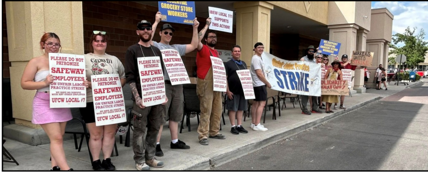
Citizens and workers on the picket line.