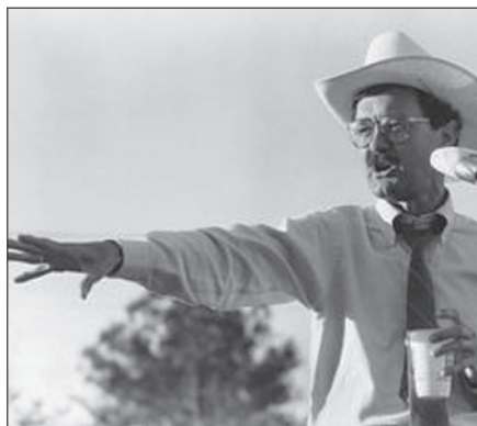
alternative media moulg, JIM HIGHTOWER

Hightower ended the interview with some advice for The Red Pill. "Develop and nurture your sense of humor; it will get you places you wouldn't get without it. And remember, the pamphleteers helped start this country, and they'll help save it." •