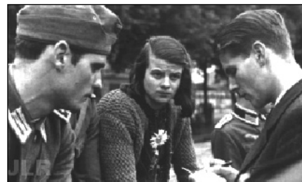
Hans, Sophie & Christoph

While distributing the last pamphlet, member Sophie Scholl was seen by a school janitor, who