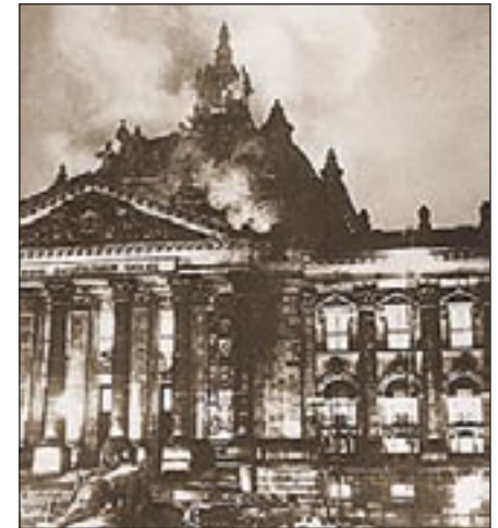
Reichstag Fire February 27, 1933

During the "Troubles" over 16,800 bombings took place in Northern Ireland and Great Britain. It has since come out that many of the explosives were provided to the IRA by the British Government and the people who built and planted the bombs were either MI5 or MI6 (Great Britain's equivalent of CIA) agents, or their informers.