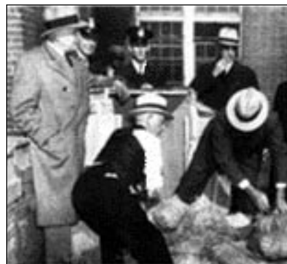
Anslinger and crew making a 'bust'

During the 1930s, the giant multinational corporation Dupont had finally perfected its wonderful new synthetic creation, Nylon. Having invested millions into the petrochemical based fiber, Dupont feared a steep rise in competition from new advances made in the field of harvesting and spinning all natural hemp into amazingly comfortable cloth, and other products. When Popular Mechanics announced the potential of hemp to be a billion dollar crop, Dupont freaked out and went to a corrupt politician, Harry Anslinger, and the mercenary media for help, William Randolph Hearst.