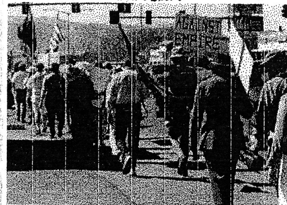
Pro-peace protesters march down North Avenue, G.J. 03/20/04