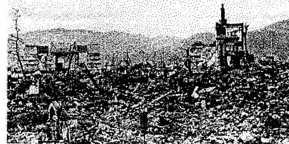
Ground Zero, Hiroshima 1945