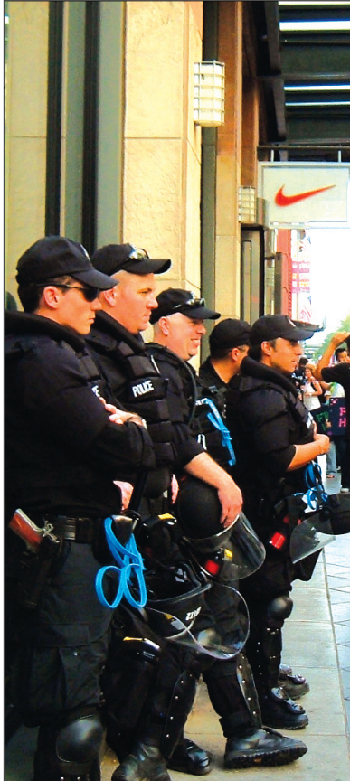
Nike Town and other corporate giants had their own police protection.