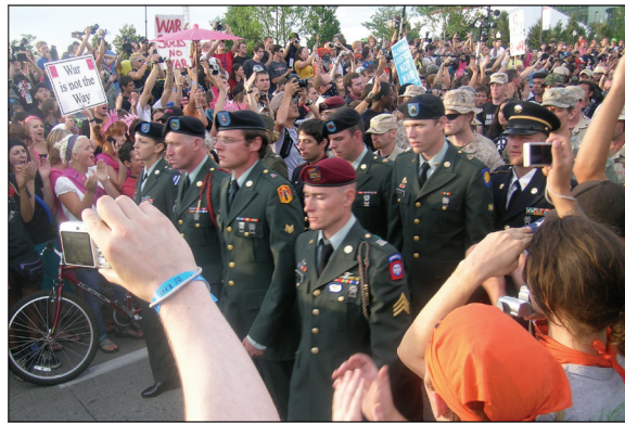
IVAW leads 10,000 people to the gates of the DNC, in an unpermitted march to demand an immediate withdraw of forces from Iraq.