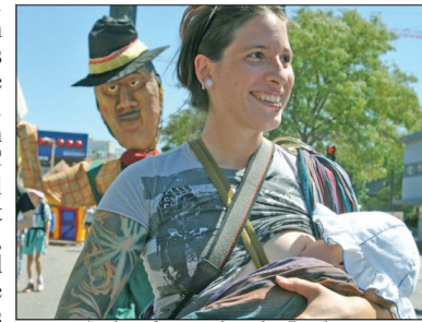
Author featured in the Rocky Mountain Post during the DNC.