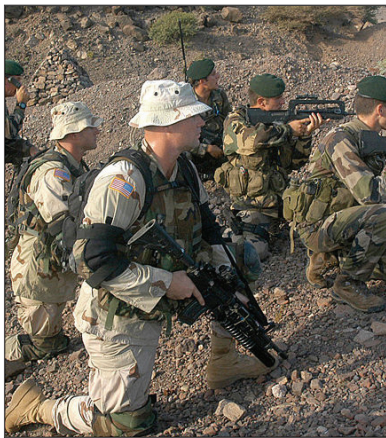
US Forces along with French Legionnaires conduct combat operations in the Horn of Africa.

The Horn of Africa is the easternmost portion of Africa that juts into the Red and Arab seas. It includes Djibouti, Eritrea, Ethiopia, Kenya, Sudan and Somalia. In various parts, the horn contains large deposits of oil and fresh water. It is of the utmost geostrategic importance; Port Sudan is less than 200 miles from Mecca and Djibouti is only 35