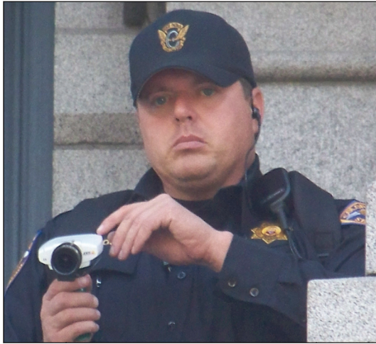
One of Denver's finest eavesdrops on protesters below.