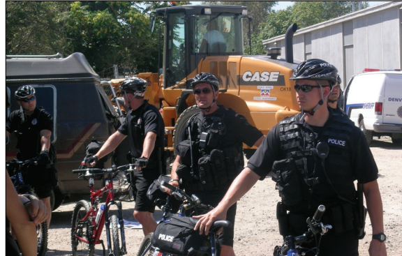
Denver Police raid the convergence center hours before the Iraq Veterans Against the War march. The bulldozer is scooping up sign making materials