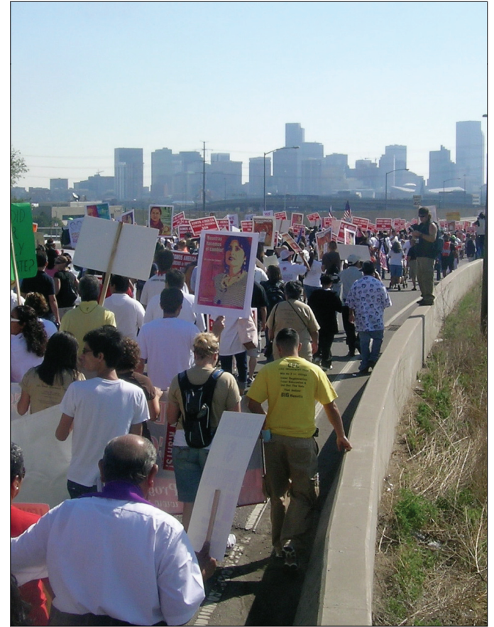
Thursday, August 28th Immigrants Rights Day. Thousands march to support immigrants.