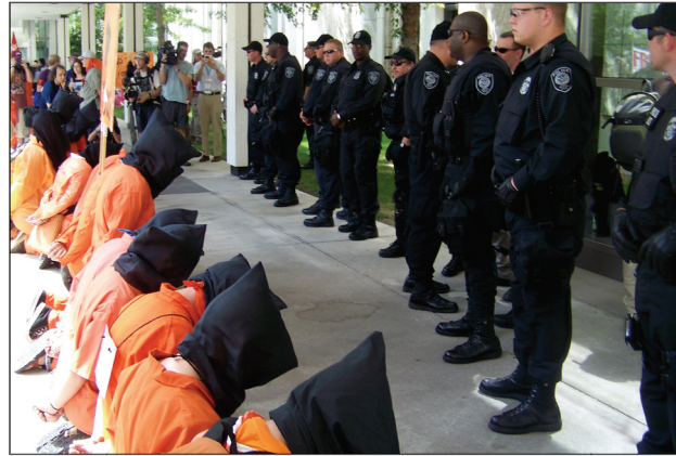
Monday, August 25th Prisoner's Rights Day. Protesters kneel in front officers in front of the Denver Federal Courthouse.